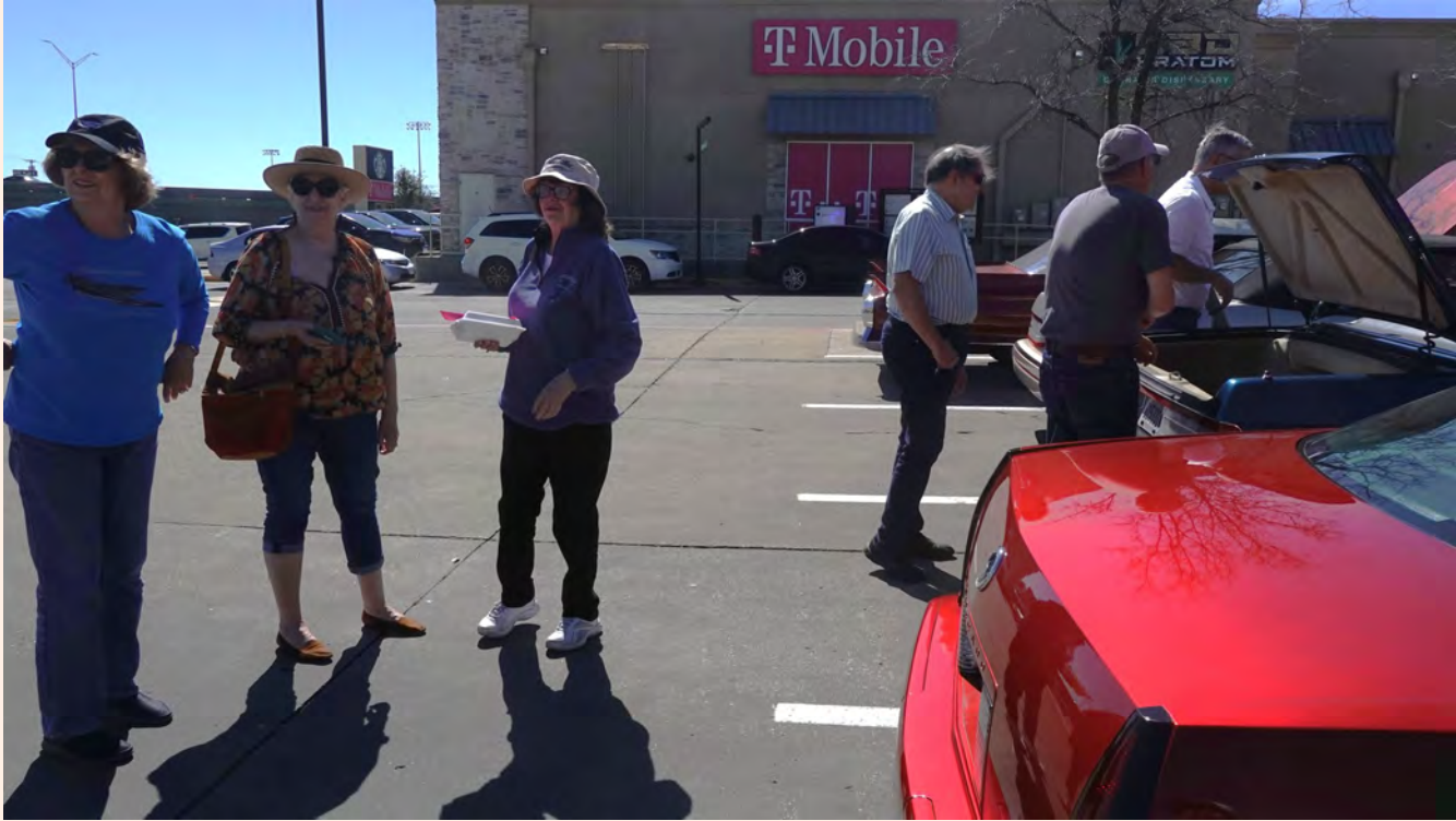
The girls enjoying socializing and the boy's only interest is these fine cars.