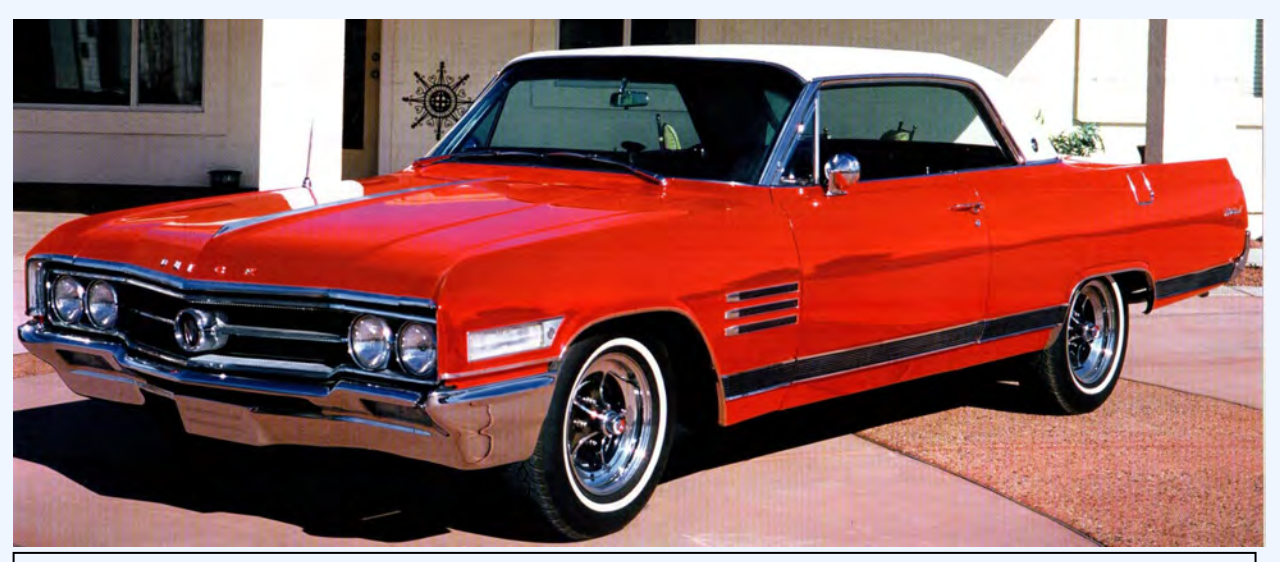
Exclusive, only Buick, are the gorgeous 15" chrome sport wheels - new 1964 Wildcat.