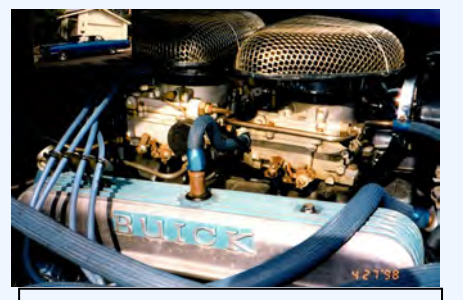
1998 photo shows my 1964 2-4's tire shredding Wildcat.