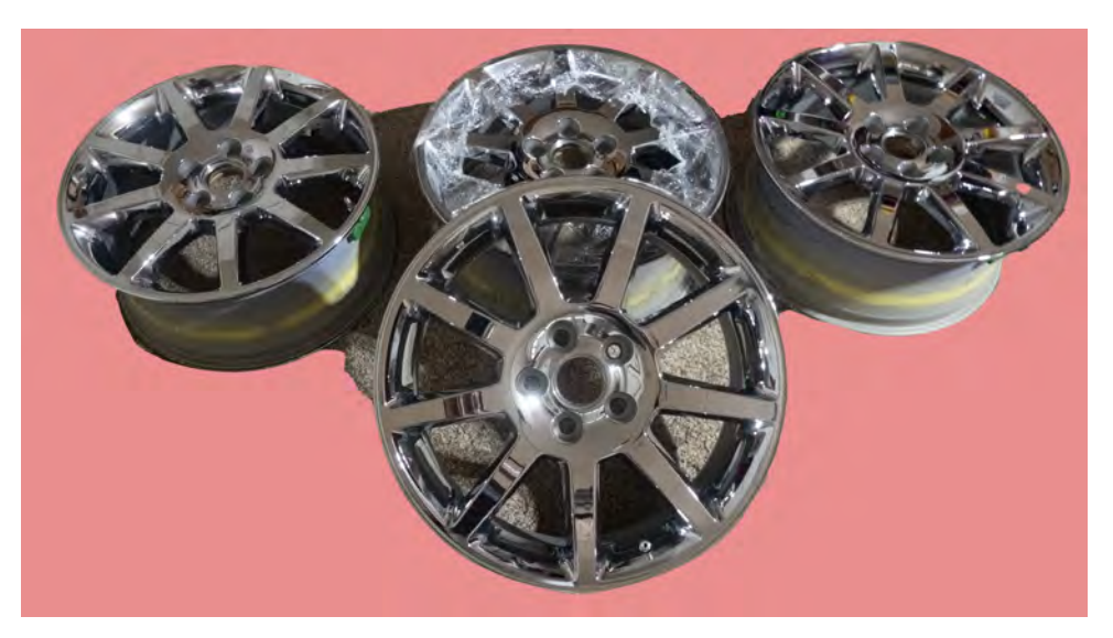
For Sale Four 2005 CTS nine spoke aluminum bright polish wheels with chrome lug bolts and TPMS senders. Condition is like new. Size—18 X 8.5 5X120 lug 48mm offset. $600.00 Shipping included.