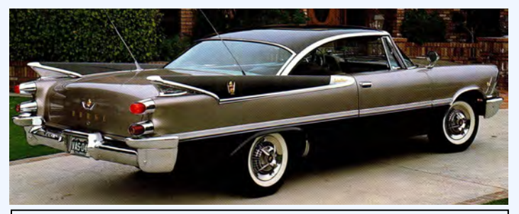
1958 and 1959 Dodge royal lancer spinners won the hearts of real car cruisers nationwide customizers.